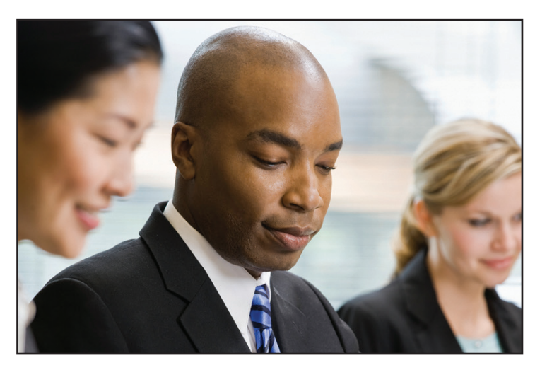
MOBILE PRINT EMPOWERS YOUR WORKFORCE WHILE GIVING YOU THE CONFIDENCE IN KNOWING YOU ARE PREPARED FOR ANYTHING AND ABLE TO ACCESS AND PRINT YOUR IMPORTANT DOCUMENTS FROM ALMOST ANYWHERE.

PRINT FILES, WEB PAGES, AND IMAGES ON DEMAND.